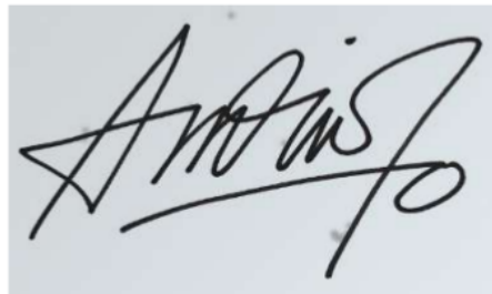
Fig. 1. Scanning process

Noise is dots on the image which are not a part of the image, but also in the image for a reason [10]. Noise is something undesirable, regarded as the cause of the lack of detail of the signature object. Therefore, noise reduction used to eliminate objects that are outside the signature area thus making the object or image detail becomes better. The result of the noise reduction process shown in Fig. 3. In image processing, normalization is a process that converts the pixel intensity range. Length and width dimensions of an object image are different. In this stage, the length and width of an object have to be recognized. In this stage, width normalization process was done by cutting the space between the edges of the image with the image object using Adobe Photoshop software. The outcome of this process is shown in Fig 4.