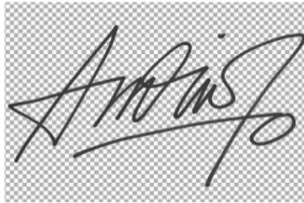
Fig. 2. Background elimination