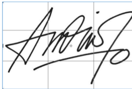
Fig. 5. Example of signature grid feature