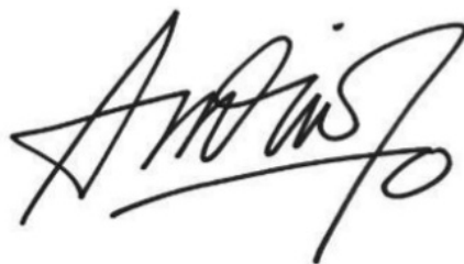
Fig. 4. The result of width normalization process

Fig. 5 is an example of a grid feature process result. In this discussion will look for the appropriate composition of the grid distribution. In general, the more the grid distribution, the greater the accuracy level, but requires memory and computation time that is greater. Therefore, it is needed to be done the grid testing of 3x3, 3x4 or 5x5. The experimental results are presented in Table 1.