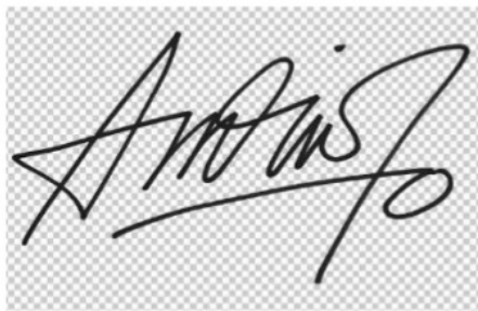
Fig. 3. The result of noise reduction process

Image processing is done to improve the image quality to be easily interpreted by a human or a computer for certain purposes, which in this study image processing used for the signature recognition. Hence, SOM Kohonen method implemented for image processing in the form of a signature. SOM Kohonen method requires some featured values that are extracted from the image.